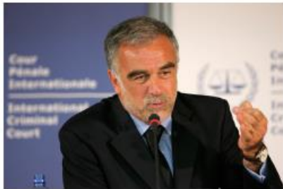
Luis Moreno Ocampo